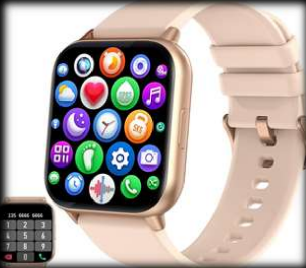
Smart Watch For Smart Business