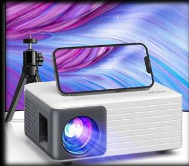
Smart Mini Projector