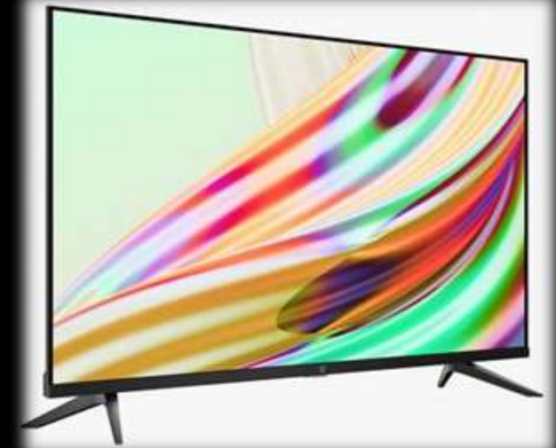
32" L.E.D Glory of The House